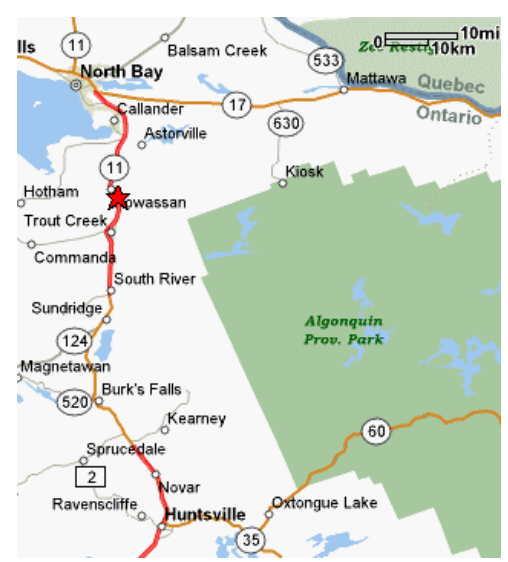
*2016 Canadian Census

The main population centre of the Municipality is the former Town of Powassan. Trout Creek forms a second, smaller population centre with a relatively large representation of retired residents. The remainder of the Municipality is largely farmland. Many residents commute to North Bay to work.